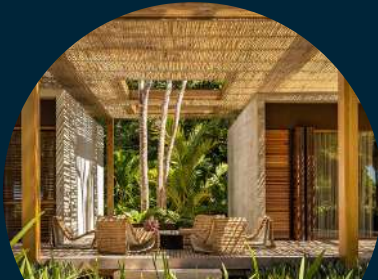
GREEN SMART HOMES RESIDENCIAS