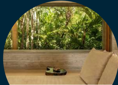
SADHU EXPERIENCE HOTEL & SPA