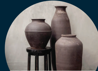
RETAIL EXPERIENCE CONSUMO LOCAL