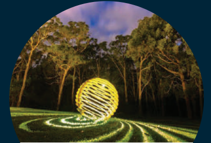
ART EXPERIENCE GALERÍA DE ARTE

SADHU Tulum integrates the network of wonderful destinations in the world to live, enjoy and heal with the seal of quality of SADHU GLOBAL WELLNESS.